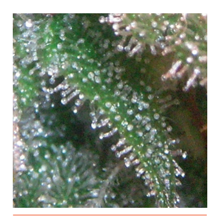
Figure 2 Closeup View of Glandular Trichomes on the Surface of a Cannabis Plant