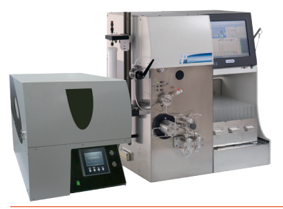
Figure 3 CPC 250 with PLC 2250 Purification System